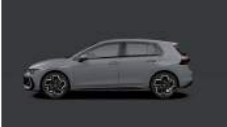
Moonstone Grey Solid