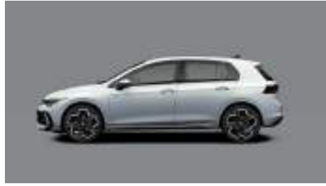
Oyster Silver Metallic