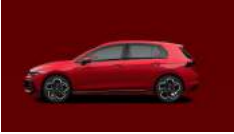
Moonstone Grey Solid