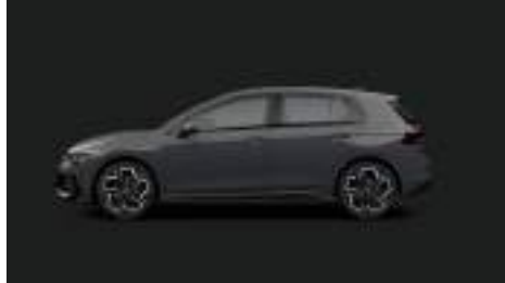
Dolphin Grey Metallic