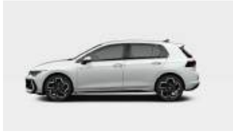
Pure White Solid