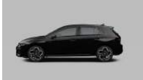
Grenadilla Black Metallic